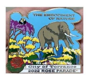
Float Pin $10.00

Our decorator and Anniversary Pins are here and the Float pin is on its way. They will be available at the October 21<sup>st</sup> meeting.