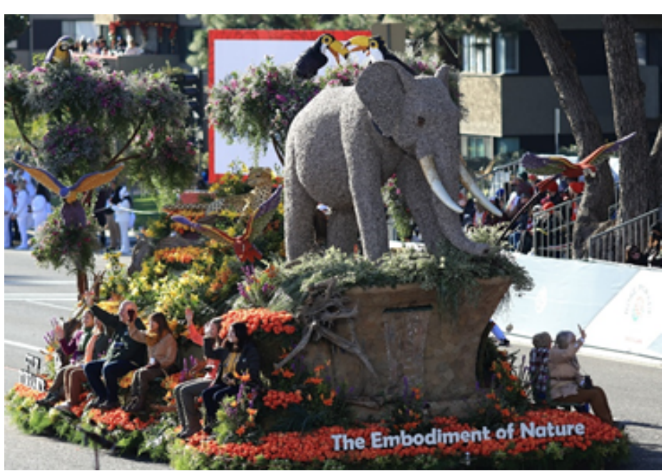
Winner of the Princess Trophy