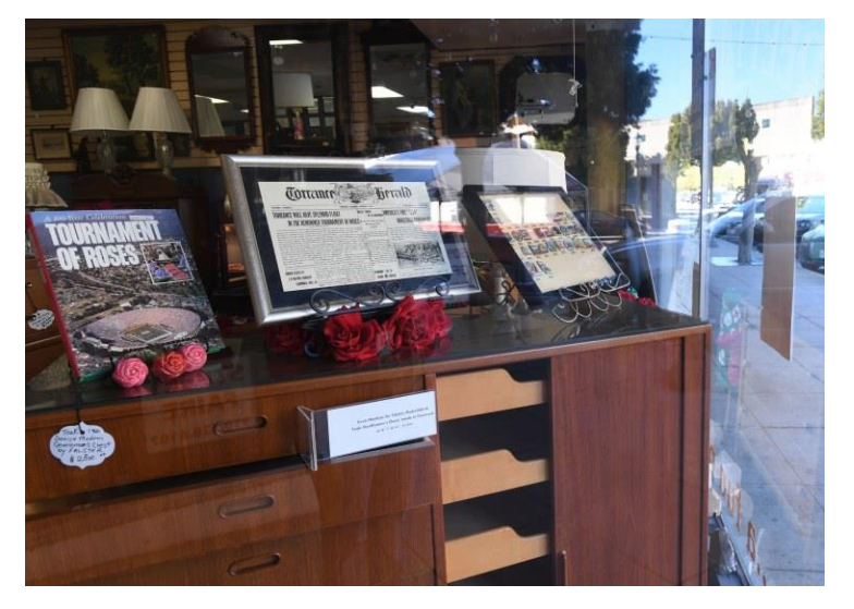
The Torrance Rose Float Association has created a scavenger hunt dubbed the Rose Float Stroll with pictures of all 52 city floats over the decades in different Old Torrance store windows. The main display, created by the Torrance Historical Society and Torrance Rose Float Association, is at Street Faire Antiques in Torrance.