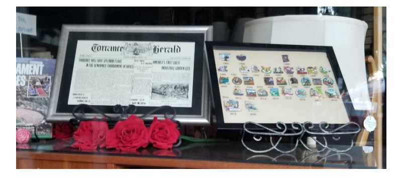
1914 Torrance Herald and collection of TRFA Pins.

2021 is the 50<sup>th</sup> Anniversary of the Torrance Rose Float Association! If you have any memories or ideas for a celebration that you would like to share contact us at one of the sites above. We would love to hear from you!