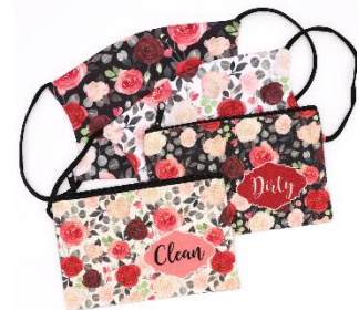
2 Zipper Bags with 2 matching Masks