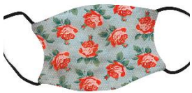
Farmhouse Rose Mask