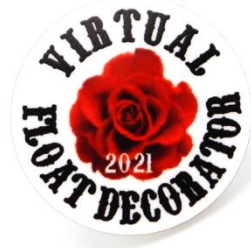
2021 Decorator Pin