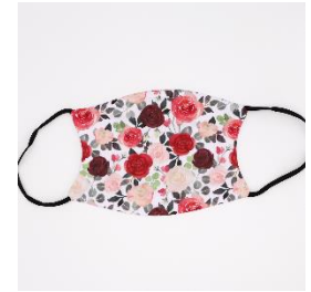
White Background Rose Mask