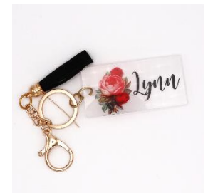
Personalized Vintage Rose Key Chain