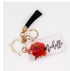
Personalized Red Rose Key Chain