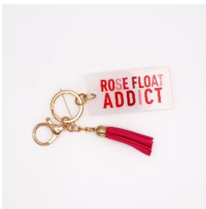
"Rose Float Addict" Key Chain