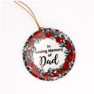
Personalized Ceramic Ornament