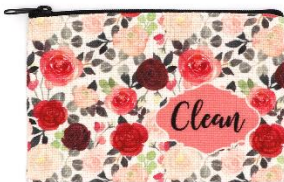
Zipper Bag for Clean Mask