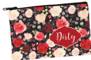
Zipper Bag for Dirty Mask