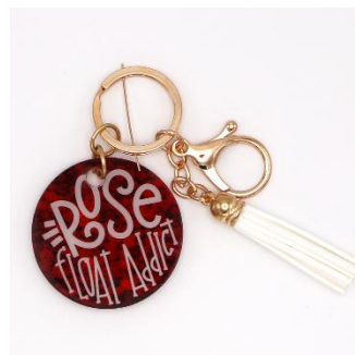
Round "Rose Float Addict" Key Chain