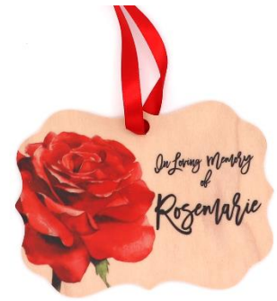
Personalized Wood Look Plastic Ornament