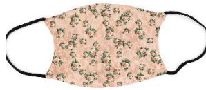
Vintage Rose Mask