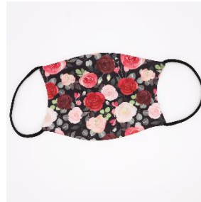
Dark Background Rose Mask