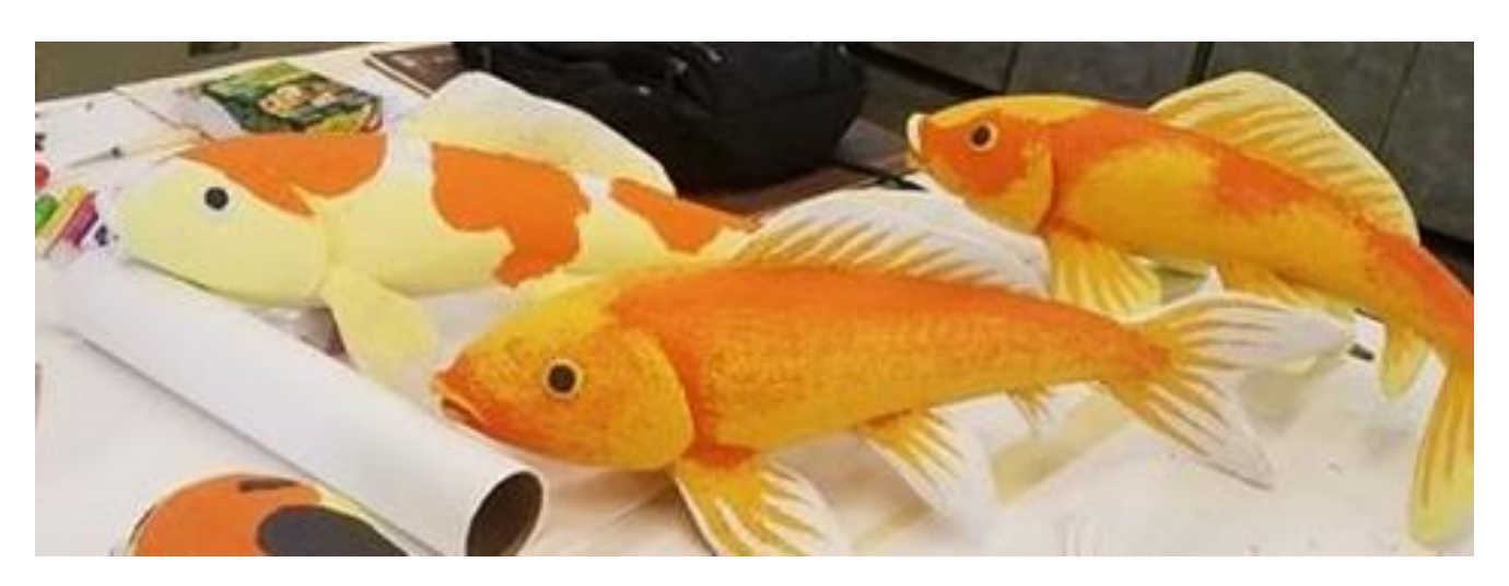
The fish are coming to life! Some exciting progress!