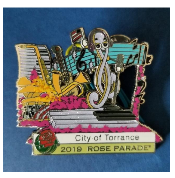
Our 2019 Float Pins are now available for $7.00 each.