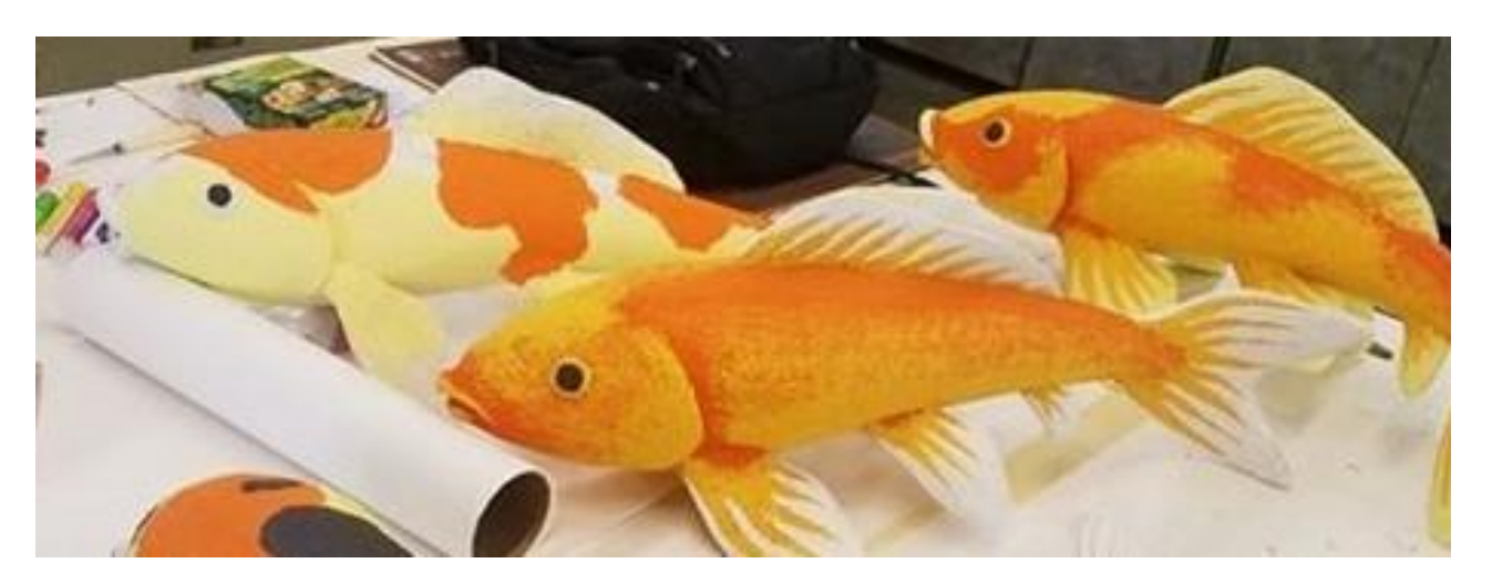
The fish are coming to life! Some exciting progress!