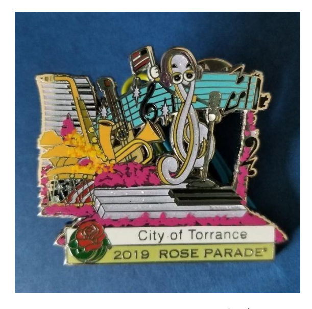
Our 2019 Float Pins are now available for $7.00 each.