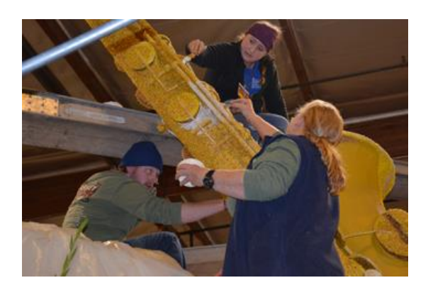
Get ready to decorate!