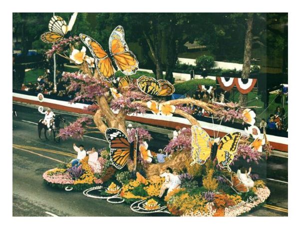
2000 CELEBRATION OF SPRING LATHROP K. LEISHMAN TROPHY