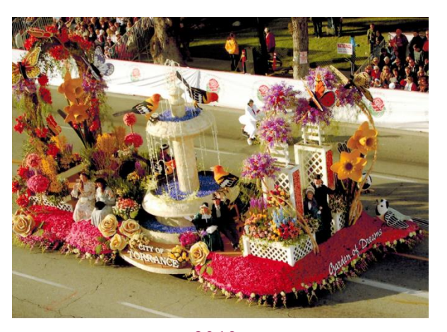
. 2010 GARDEN OF DREAMS LATHROP K. LEISHMAN TROPHY

And need to have one mailed to you during this time please call our hot line and let us know. 310-618-2425