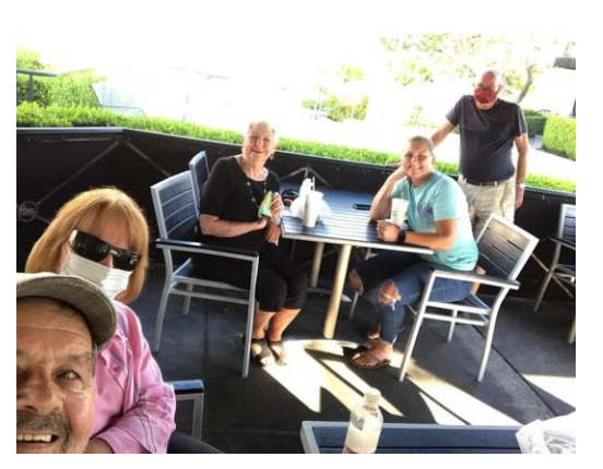
Some of our members at Fishbonz.