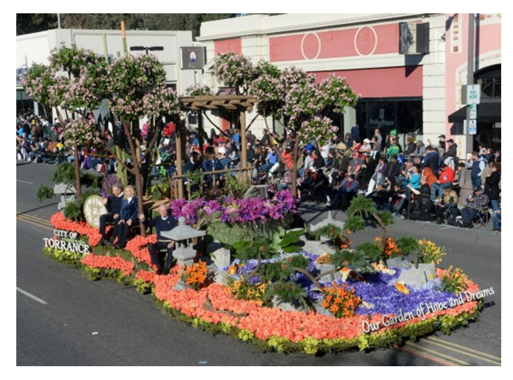
Our Garden of Hope and Dreams Princess Trophy